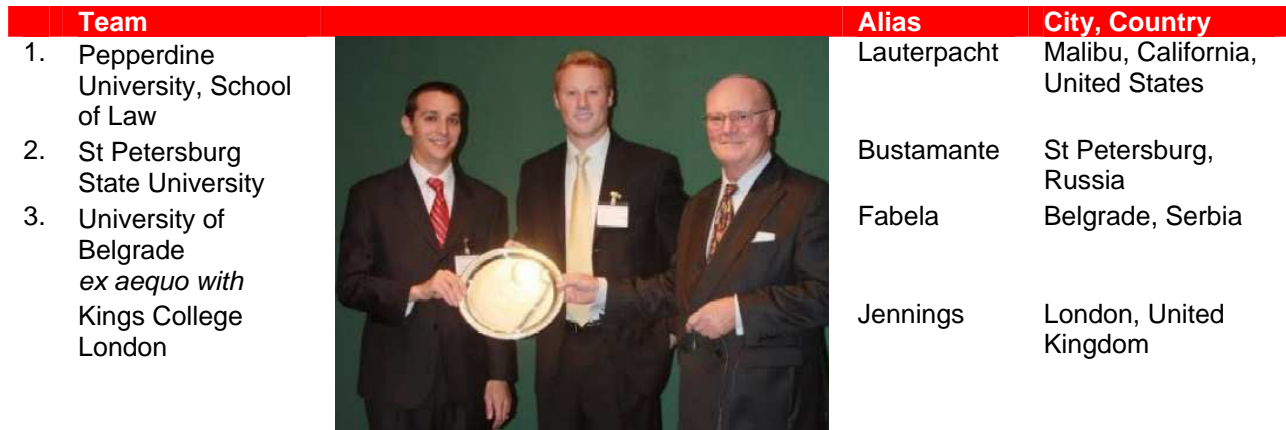
Pepperdine University School of Law with the Skadden Arps Trophy