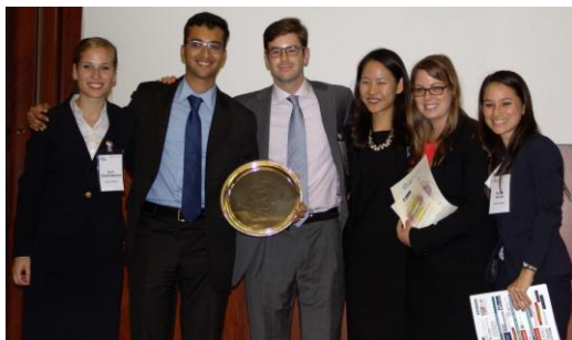
Harvard Law School